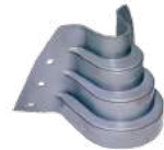
SMALL FLANGED STEP REDUCER